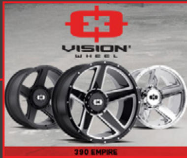
Sample Website Ad Banners